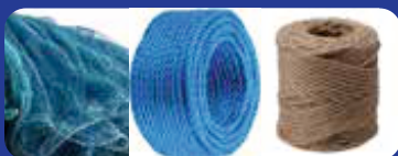
Cordage, Fishnets, Ropes & Twines