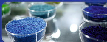
Plastic Raw Materials, Polymers & Masterbatch