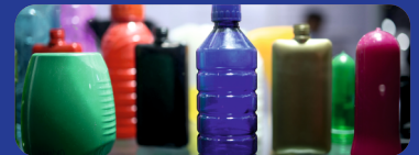
Rigid Packaging & PET Preforms