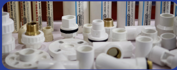
Plastic Pipes & Fittings