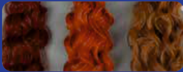
Human Hair & Related Products