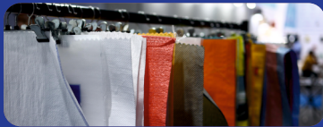
FIBC, Woven Sacks, Woven Fabrics, Tarpaulin