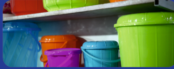
Consumer & Housewares Products