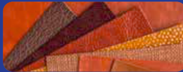
Floor Coverings, Leather Cloth & Laminates