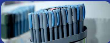
Writing Instruments & Stationery