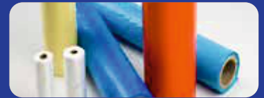
Plastic Films & Sheets